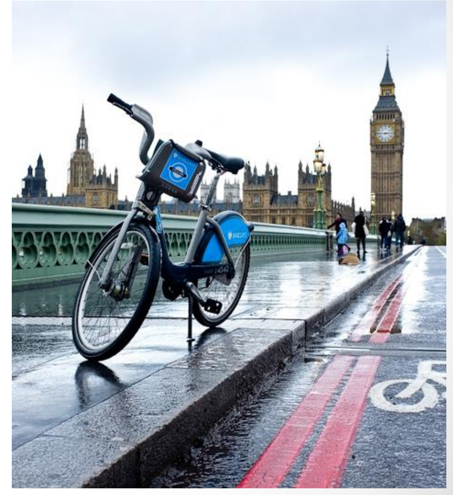
London Barclay's Bike for Hire