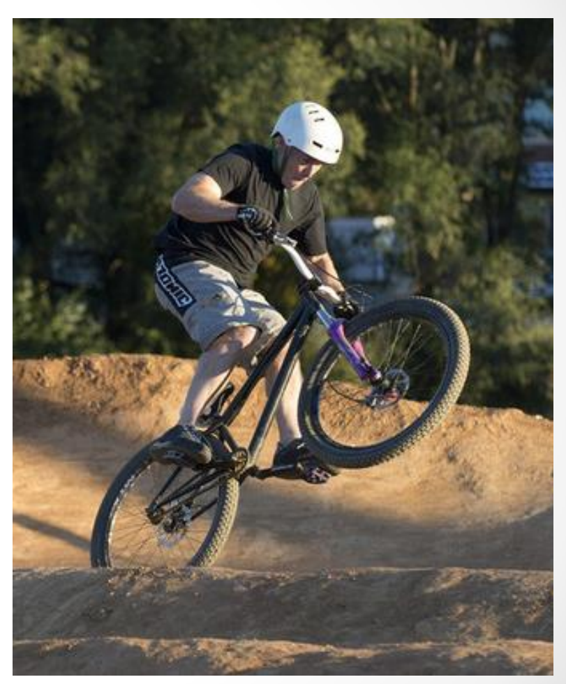
Frederick Bike Coalition Pump Track